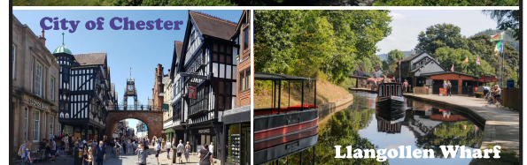
City of Chester