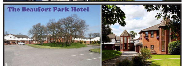
The Beaufort Park Hotel