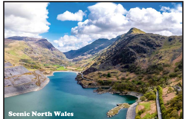
Scenic North Wales

Price includes: All Luxury Coach Travel, Half board accommodation, Three full day excursions with boat trip and evening entertainment.