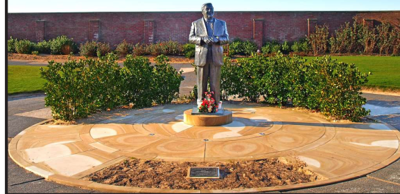
Statue of Les Dawson, St. Annes on Sea