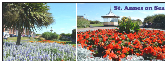
St. Annes on Sea

Price includes: All Luxury Coach Travel, Half board accommodation as described, Two full day excursions, a full Turkey & Tinsel programme with evening entertainment & Traditional Christmas menu.