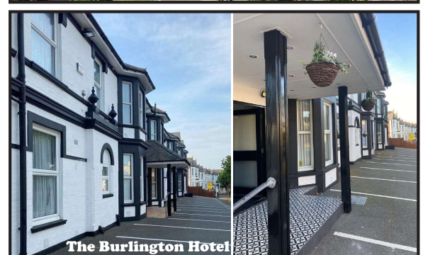
The Burlington Hotel