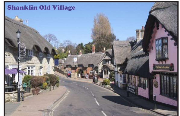
Shanklin Old Village

Price includes: All Luxury Coach Travel, Half board accommodation, Ferry crossings, Two full day excursions, and evening entertainment.