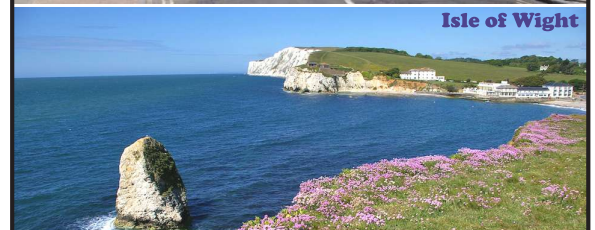
Isle of Wight