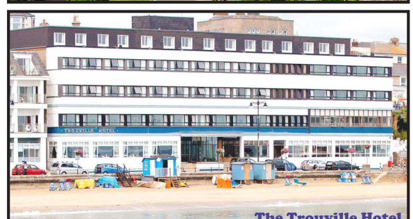
The Trouville Hotel