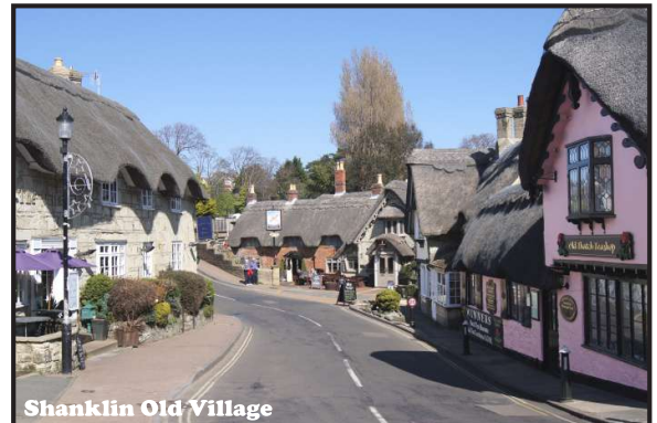
Shanklin Old Village

Price includes: All Luxury Coach Travel, Half board accommodation, Ferry crossings, Two full day excursions, and evening entertainment.